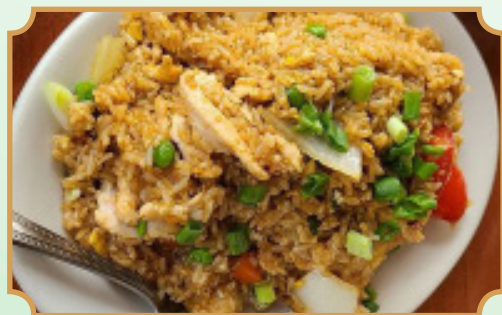
Combinations Fried Rice