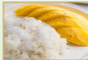
Sweet Sticky Rice w/Mango