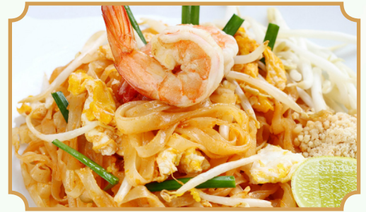
Pad Thai Noodles

Vegetarian Choice of: Tofu,Veggie or Mock Duck 16.95