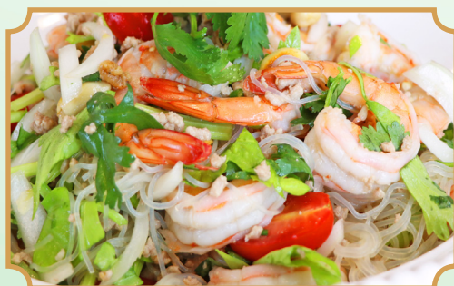
Yum Woon Sen