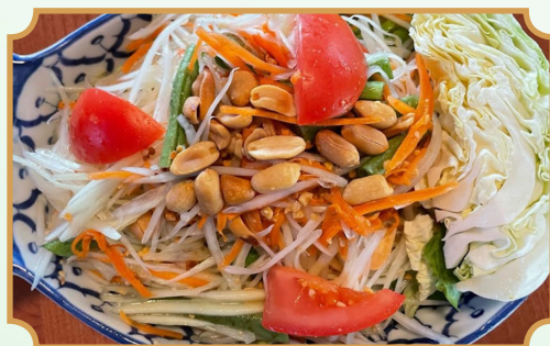
Green Papaya Salad