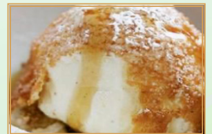
Fried Ice Cream