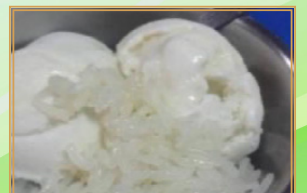
Sweet Sticky Rice w/Ice Cream