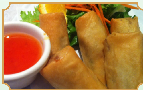
Deep Fried Roll