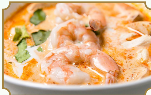
Tom Kha Shrimp