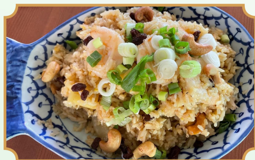
Pineapple Fried Rice