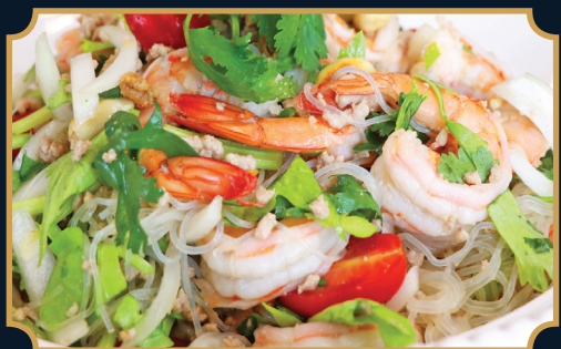
Yum Woon Sen