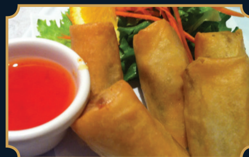
Deep Fried Roll

20% Gratuity will be added for Parties of 6 or more.