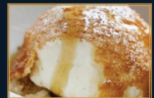
Fried Ice Cream