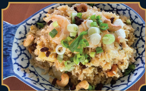
Pineapple Fried Rice