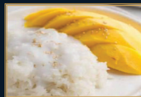
Sweet Sticky Rice w/Mango