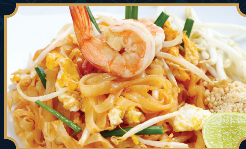
Pad Thai Noodles