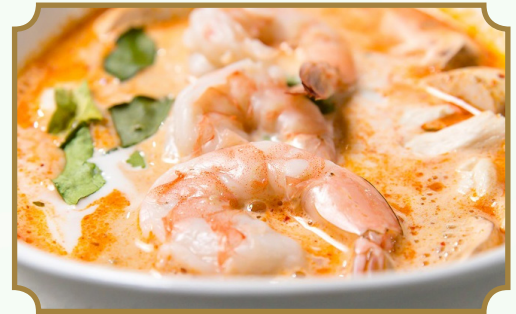
Tom Kha Shrimp

Vegetarian Choice: Tofu, Veggie, Mock Duck Small $8.95 Large $14.95