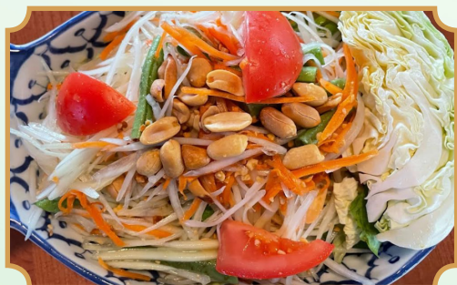
Green Papaya Salad