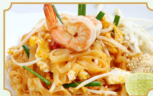
Pad Thai Noodles