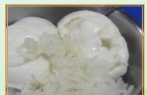
Sweet Sticky Rice w/Ice Cream