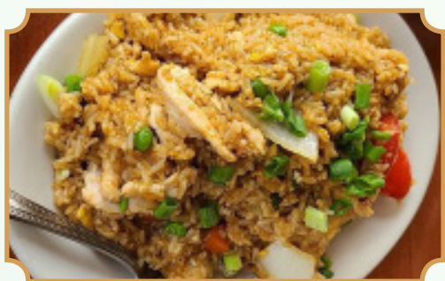
Combinations Fried Rice